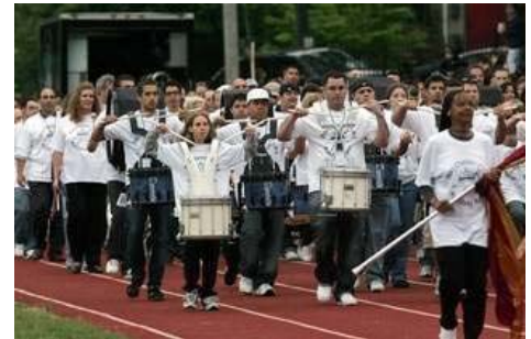
Port Chester High School hosts the district's 65th annual Band Night yesterday, which featured alumni and student bands marching across the high school's Ryan Field.

PORT CHESTER - Performances by the elementary and middle school bands - as well as the "Pride of Port Chester," the high school band - were followed yesterday by a band composed of alumni from as early as the class of 1942 as the school district marked its 65th annual Band Night.