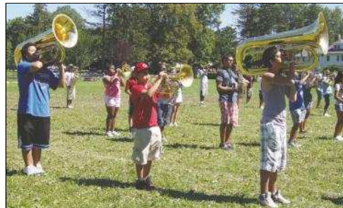
The Port Chester High School Band practices playing the music in place before trying to march and play simultaneously during the second week of band camp at Crawford Park Tuesday.